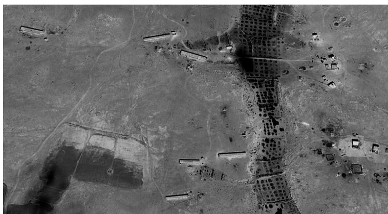
Figure 1. Poultry shed appearing on “Google earth” aerial images.

Observations are based on data collections during farm visits, and interviews with farmers, traders, technicians, veterinarians and feed manufacturers. Identification and georeferencing of poultry farms was done by examination of successive aerial images of the region (2000-2012) available on Google Earth website. Figure 1 shows an image with 6 poultry sheds. They are easily identified on aerial photographs thanks to their typical long shape which correspond to no other buildings in the region of Matruh